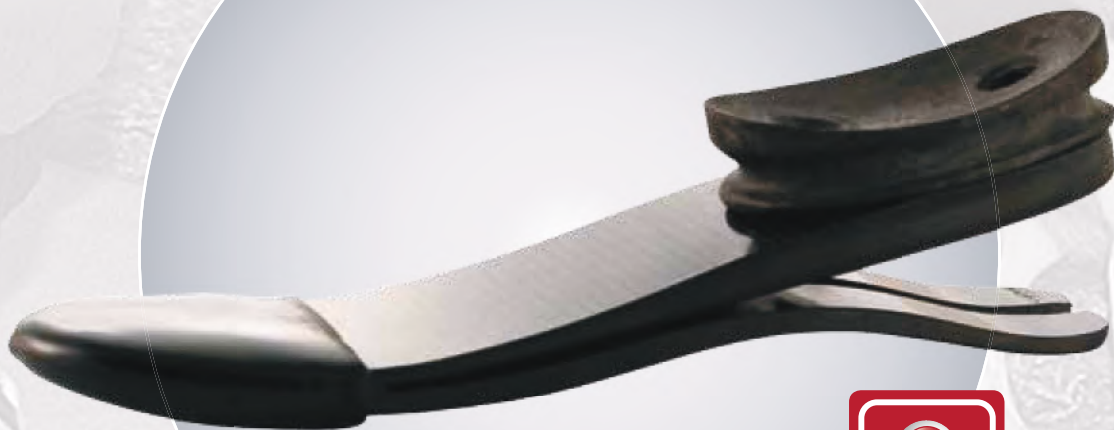
LP Symes (LP2)