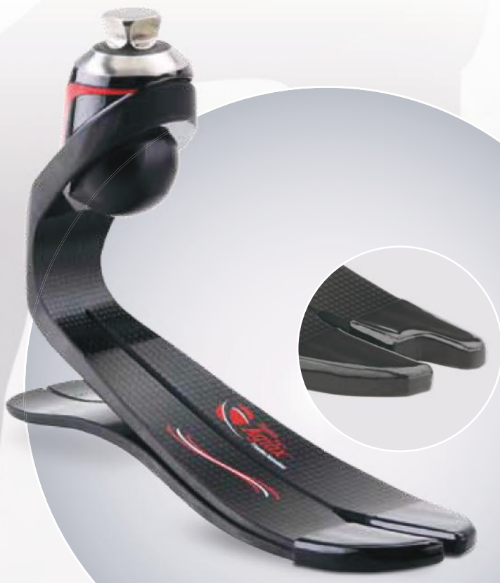
Freedom Agilix (F15)